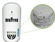
空气消毒机 Air Sanitiser Fan

尺寸/Size: H 219.5mm x W 102.5mm x D 92.5mm