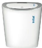
感应式女士卫生箱 No Touch Feminine Hygiene Unit