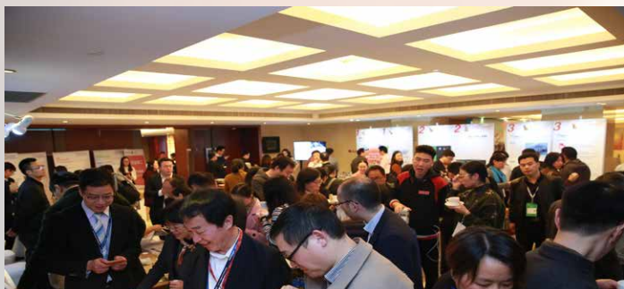
9 Exhibitors brought their latest solutions