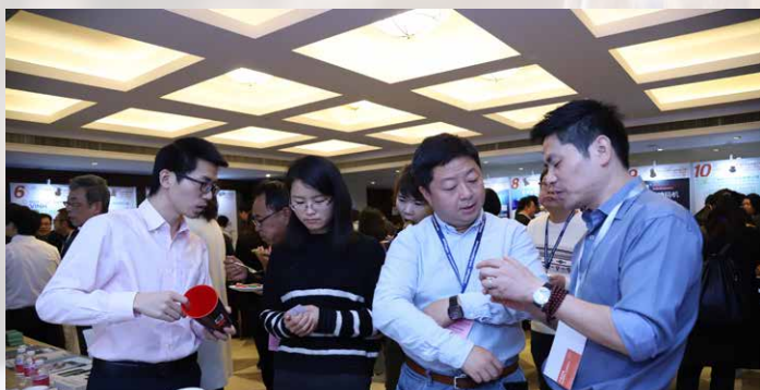
Innovative packaging technology by Technimark China