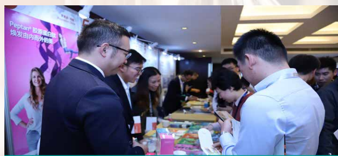
The latest protein solution- Peptan 2 - by Rousselot China