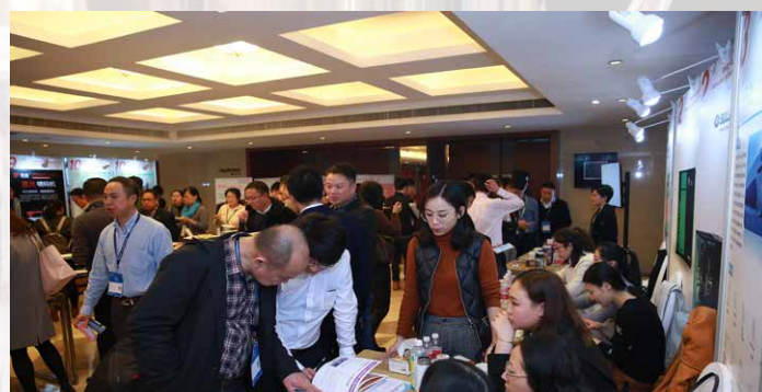
Bacterial solution from UAS Labs, presented by Wader Group