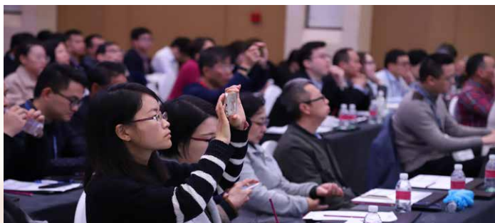
Two sessions, 17 Keynote speeches on industry trends