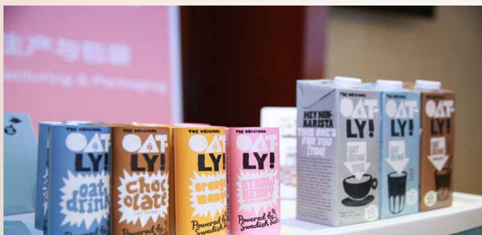
Plant protein oats drink by Oatly from Sweden