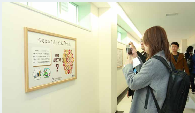
Curious and Serious Visitors