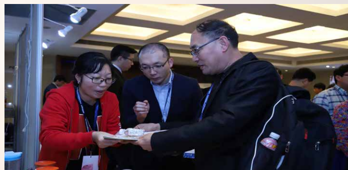
Apple vinegar by Kewpie International