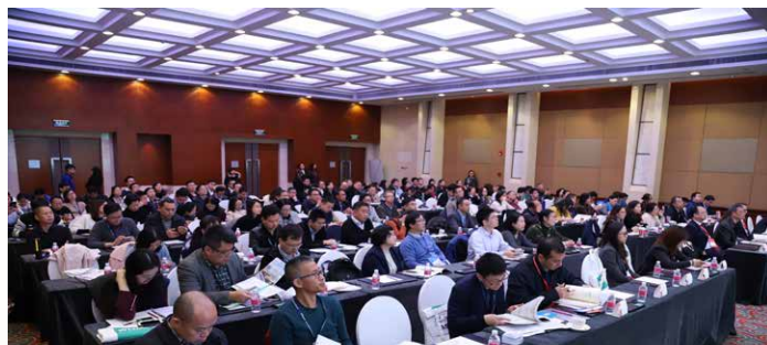
200+ Food and Beverage professionals from processing, R&D, QC, brand and other departments