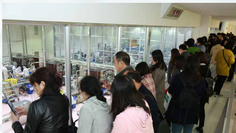
The Production Line Attracted Lots of Visitors