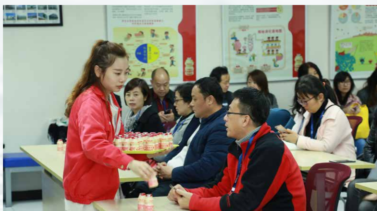
Yakult's Staff Explained the History and Benefits of Probiotics