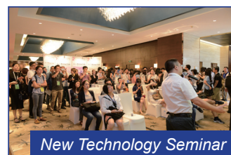
New Technology Seminar