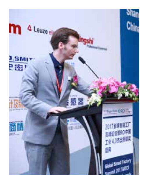
Statement by The Timo