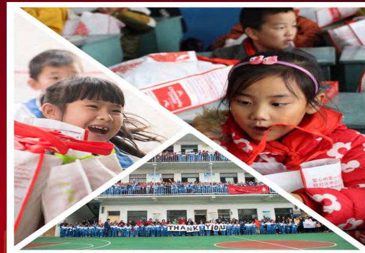
Raise Fund for Giving Tree