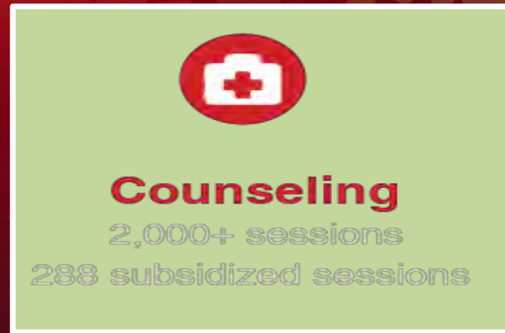
Raise funds for Subsidized Counseling