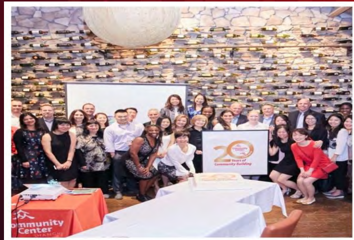
Over 20 years of service