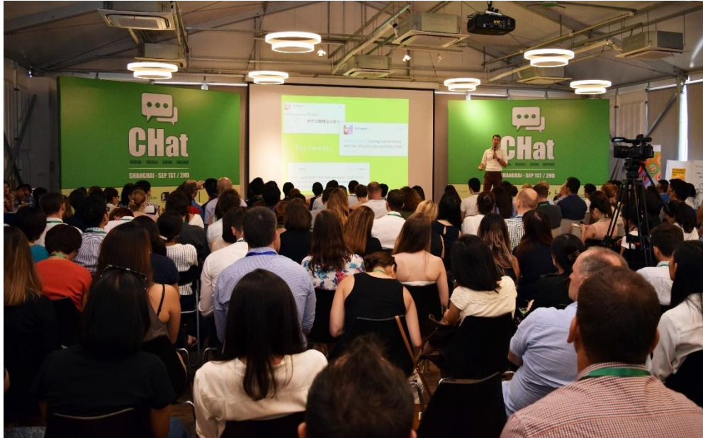
Main hall stage

Numbers 1 to 11 denote exhibition booth spaces. N.B. First choice of spaces will be given to event sponsors.