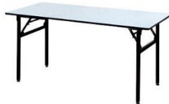
Table size: IBM table, standard size of 46W x 180L x 76H cm

Power socket, 1 seat and table cover will also be provided.